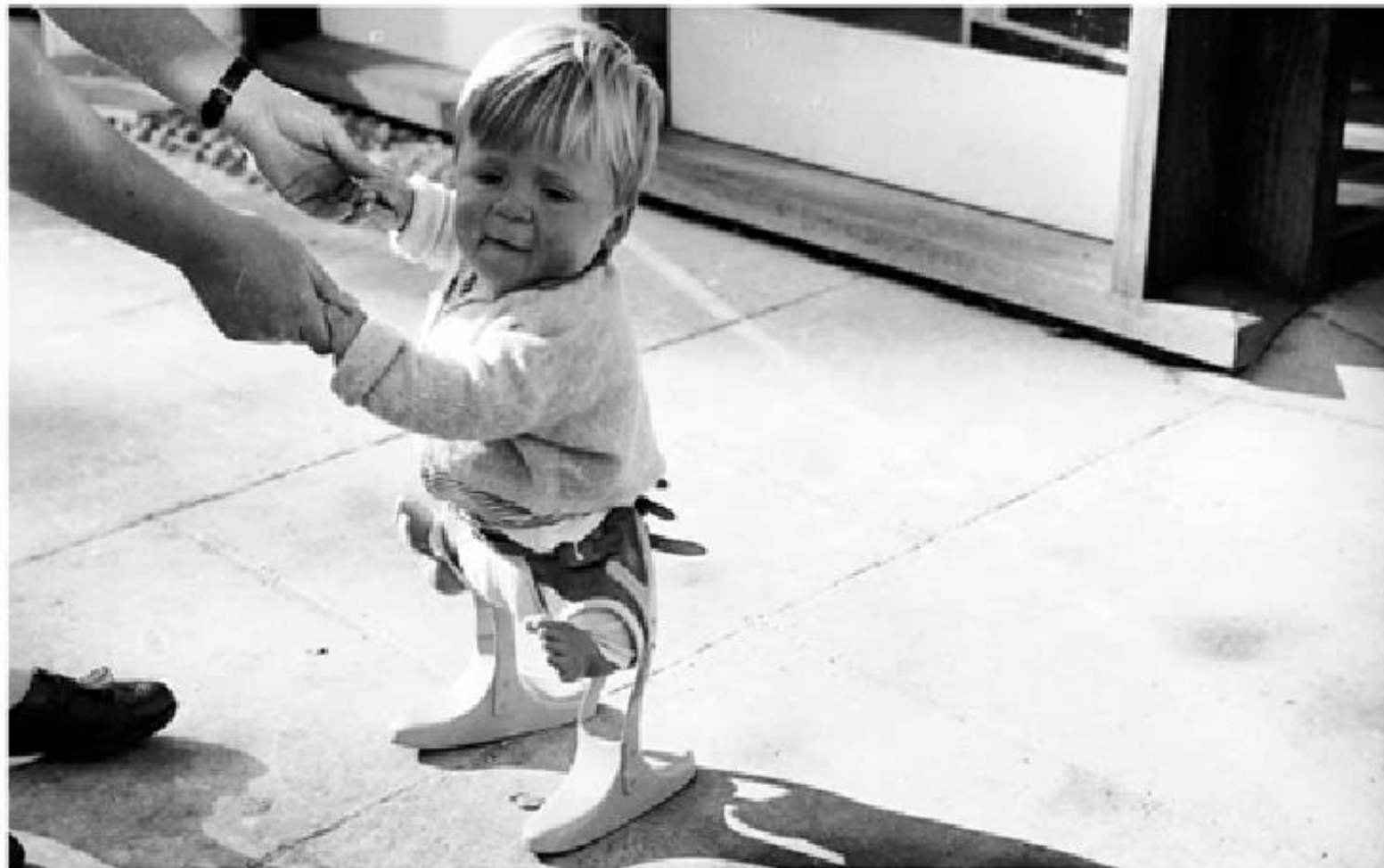
▲ A thalidomide survivor in therapy at Challey Heritage in East Sussex.

Former head of the Thalidomide Trust says many mothers would not have known drug was the cause of miscarriage or stillbirth